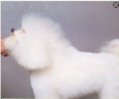
17. Before cutting the side of head. Be sure to comb always carefully.