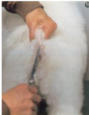
5. Cut unnecessary hair around the anus.