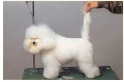
3. Cut to the middle of forelegs and hind legs. Cut in parallel to the floor.