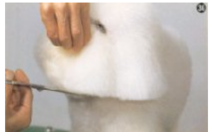
30. Connect the line from the front breast to the beard.