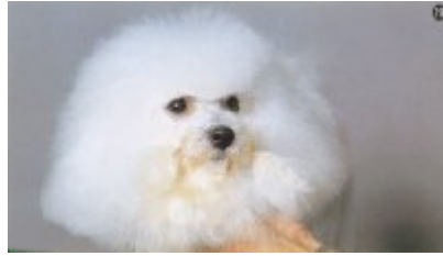
24. Cut from the highest point of the head to the neck and the back line.