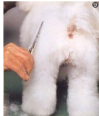
8. Connect the outside line of both hind legs to the back line. Cut to make always natural round.