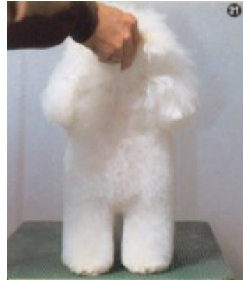
16. Finish of the front