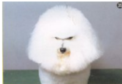
29. Cut from the center of beard to ears.