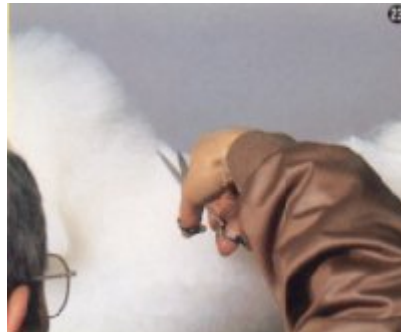
18. Decide the line from the continuation of the back line to the top of the head keeping the total balance.