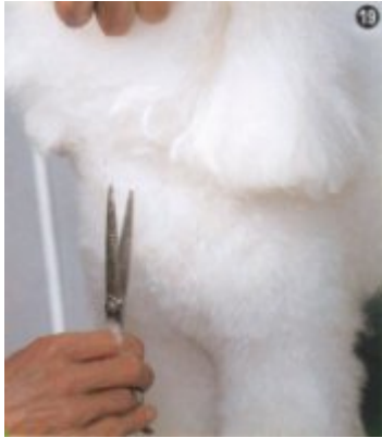
14. Cut the front breast roundly from each part of forelegs to around the throat.