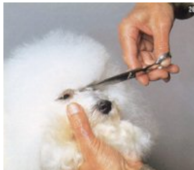
21. Cut the hair between the eyes.