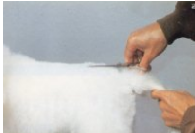
2. First, cut the vicinity of the tail along the back line after seeing the total balance.