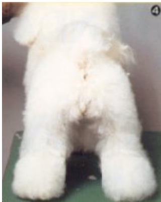
4. Comb carefully before cut, and then cut from the back.