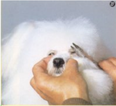
23. Finish of surroundings of eyes and before cut of the front head.