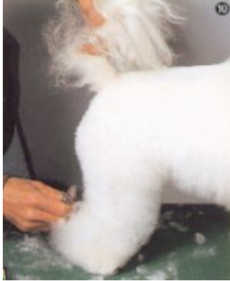
9. By looking from the side, cut from the tail to the hock keeping the balance.