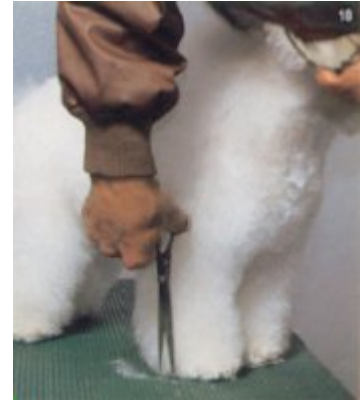
13. Cut the inside, the front, the side and the back roundly and vertically. Keep in mind to make your Bichon standing correctly.