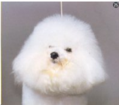
20. Before cut of the face