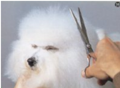
26. Connect the line from the head to the each part keeping the balance of all over the body and the head size.