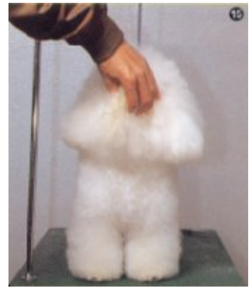
12. Before cut of the front.