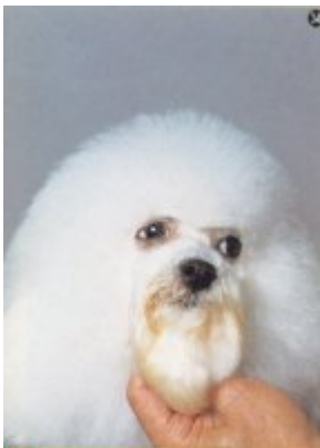
28. Before cut of the beard.