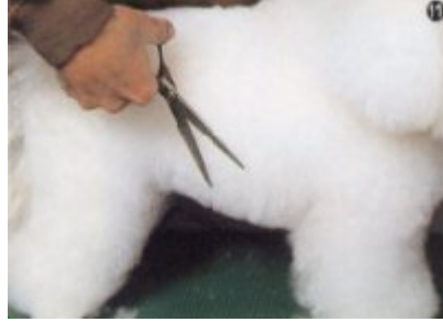
10. Cut the underline from the elbows of the forelegs to the groins of the hind legs. Connect the side of the body line making hind legs, top line and underline roundly.