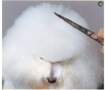
25. Cut from the side of the head to back of the head.