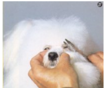
22. Cut from the head of the eye to the corner of the eye carefully.