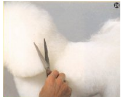
19. Connect the neck with the top line from the rear ears. Finish the other side as well.