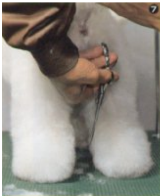
7. Cut the outside of the hind legs vertically. Connect the inside and the outside line roundly.