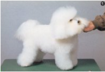
1. Before cut. Check merits and demerits of your Bichon at this time.