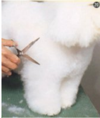
15. Connect around the shoulder line with the front breast, forelegs and the back of the side keeping balance.